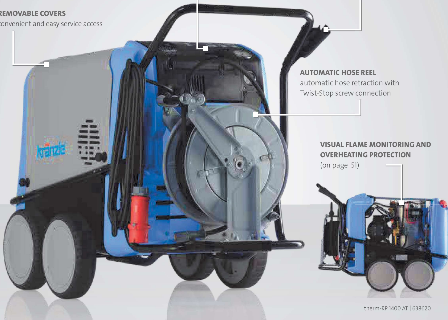
therm-RP 1400 AT | 638620