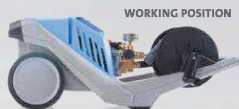
K 1154 TST | 602050